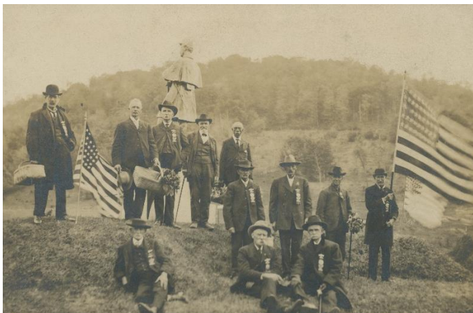
Henry Van Aernam Post, #232 GAR, Ellicottville, NY. Sunset Hill Cemetery